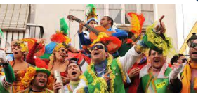
The carnival in Cadiz