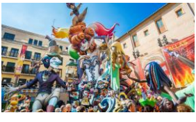
Spanish festivals and traditions.