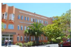
What schools are like in Spanish speaking countries.