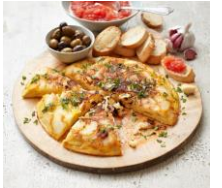
Ordering food and drink when in Spain.