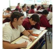
School life in Spain.