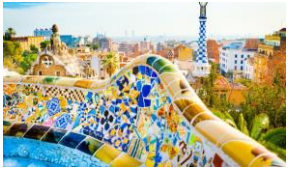
Places to visit in Spain.