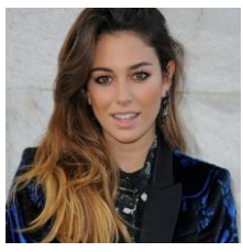
Famous Spanish people.