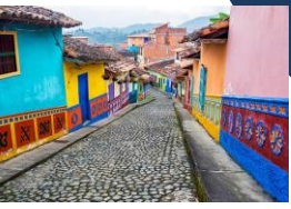
Spanish speaking holiday destinations.