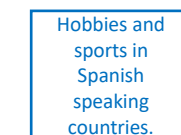
Hobbies and sports in Spanish speaking countries.