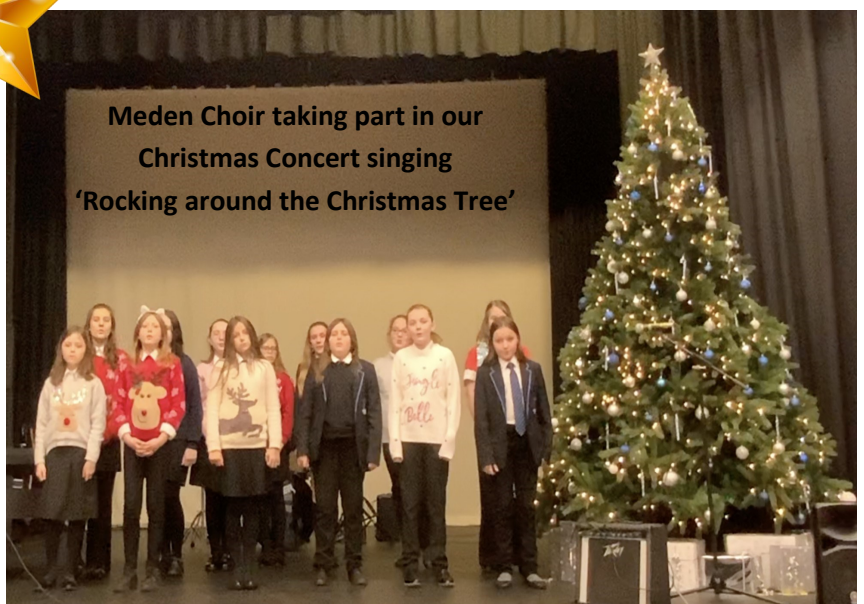
Meden Choir taking part in our Christmas Concert singing 'Rocking around the Christmas Tree'