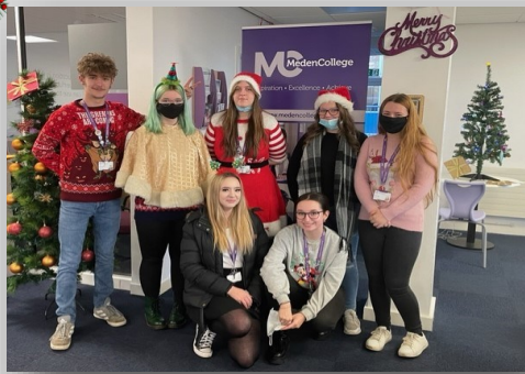
Meden College students proudly wearing their Christmas jumpers to raise money for charity on National Christmas Jumper Day.